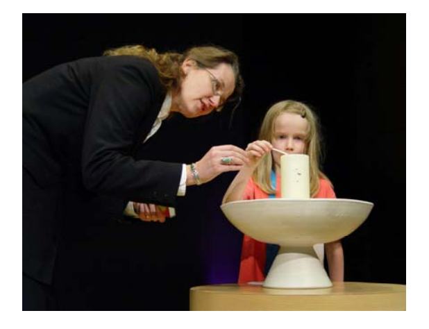
Worship at the Annual Meetings

We welcome invitations from districts and congregations to lead worship workshops. The first of these, a day for the Yorkshire Union's lay preachers on alternatives to the hymn sandwich, is scheduled for February, 2009.