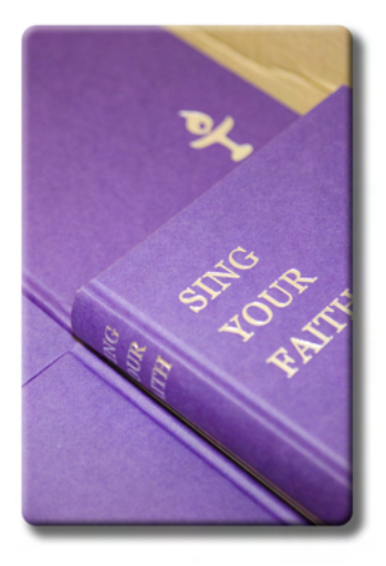
New hymn books

The great achievement of the year lay in the publication of the new hymn book Sing Your Faith which had been put together by dedicated work over some years by the ad hoc Hymn Book Panel. The book proved so popular (and at such a competitive price!) that the 2,000 copy print-run was swiftly exhausted and a reprint became necessary. The book was well publicised, by the 2009 GA Press Officer, in local and regional papers relevant to contemporary Unitarian contributors, and was featured on BBC local radio stations in two areas. The involvement of the Lindsey Press Panel lay principally in advising on some of the bibliographic technicalities.