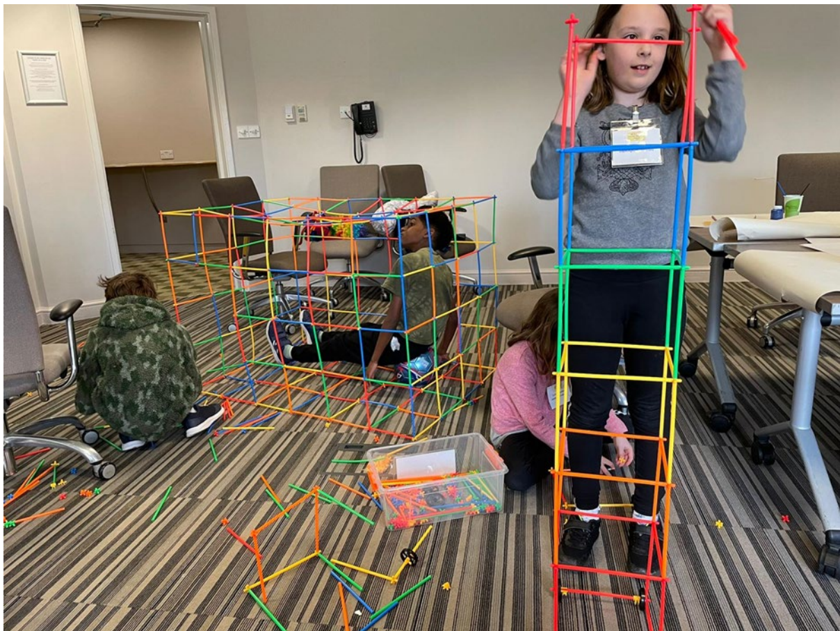
Free play is an important part of what we do.

For the entirety of the Annual Meetings, the General Assembly will have exclusive use of the main venue (the spa and golf club will remain open to the public, but these are in a separate building). This will help us to make and maintain a safe space for all. All our youth volunteers are appropriately DBS checked to ensure their suitability to support this event. There will be an appropriate number of first aiders on site throughout the meetings.