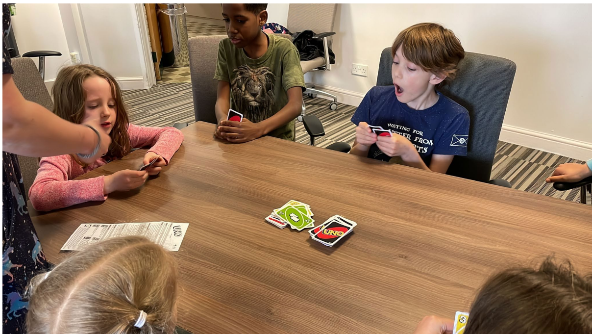
Participants getting to know each other.

Our intention is to nourish the spirit of our participants through kindness, friendship and play.